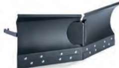
49. X blade