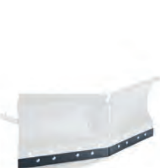
28. Rubber scraper blade