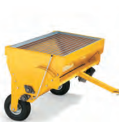
29. Sand spreader