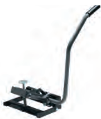
26. Rear tool lift manual