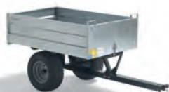
19. Pro cart galvanized