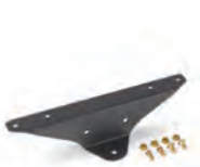
2. Trailer hitch