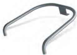
1. Cargo rails