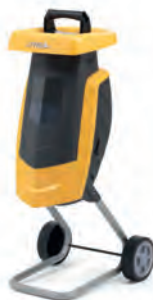
BIO SILENT 2500