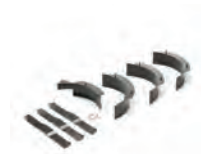
5. Mulching kit