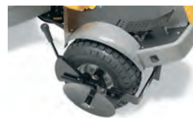
5. Edge cutter