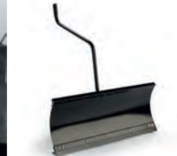
40. Snow blade