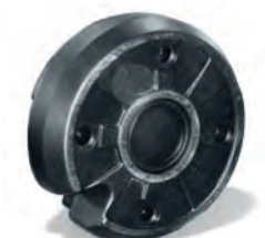
36. Rear weight