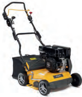
SVP 40 G