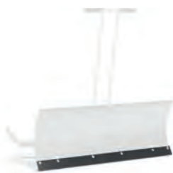
27. Rubber scraper bar / blade