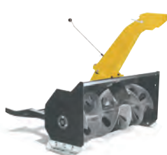
39. Snow thrower