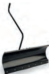
32. Snow blade