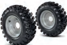
48. Winter wheels