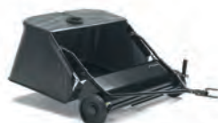
13. Grass & leaf collector