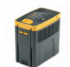
43. Stiga battery E 475