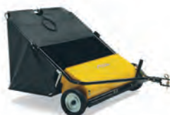
12. Grass & leaf collector