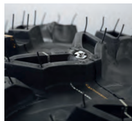
39. Snow tyre spikes