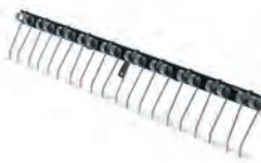
24. Rake tool