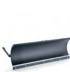
34. Snow blade