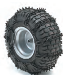
35. Snow chains