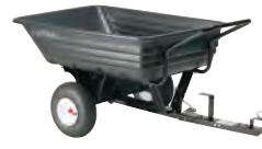
29. Combi cart