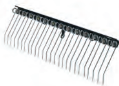
23. Rake tool