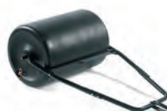
34. Poly roller