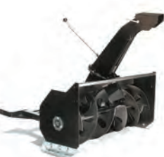
38. Snow thrower