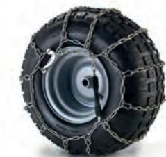
38. Snow chain