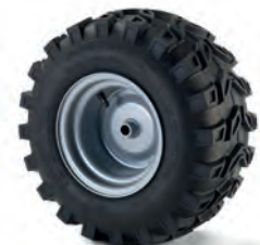
37. Winter tyres