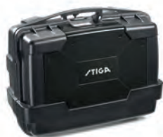
2. Carrier Case