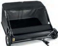
31. Grass & leaves collector