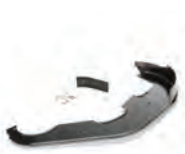
4. Mulching kit