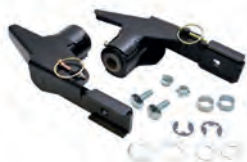
21. RAC Quick connection