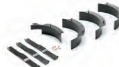
50. Mulching Kit