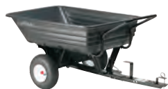
3. Combi cart