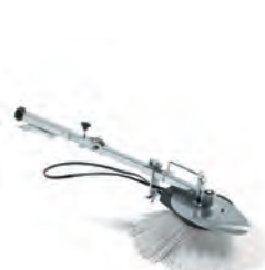
30. Side brush