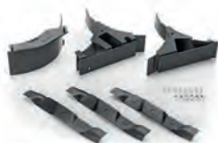
17. Mulching Kit