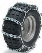
36. Snow chains