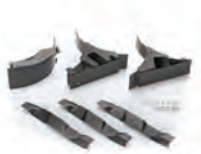
3. Trailer hitch