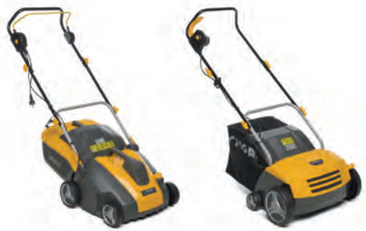
SV 415 E