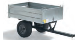
30. Pro cart galvanized