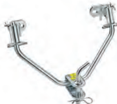
27. Trailer hitch