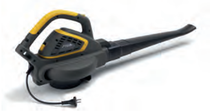
BL 130c V