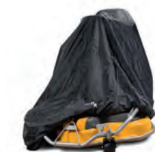
20. Protective cover Stiga