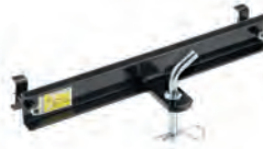
28. Trailer hitch