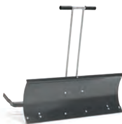
31. Snow blade