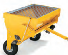
33. Sand spreader