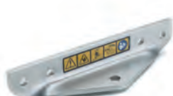
47. Trailer hitch