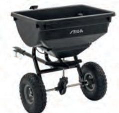
32. Fertilizer spreader