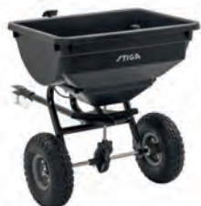
6. Fertiliser spreader