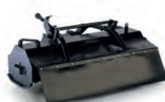
44. Flail mower