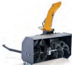
37. Snow thrower