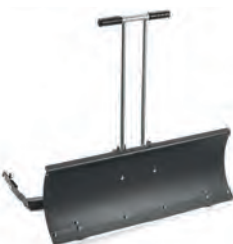
33. Snow blade