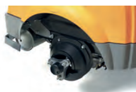
11. Frame weights