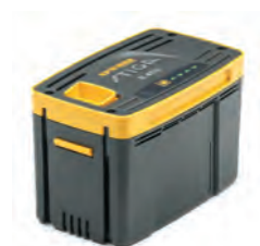
42. Stiga battery E 450