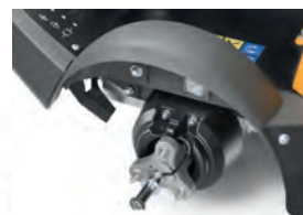
10. Frame weights