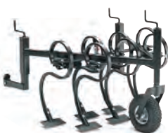
41. Spring hoe