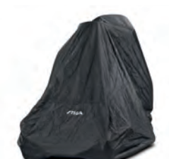
46. Stiga protective cover