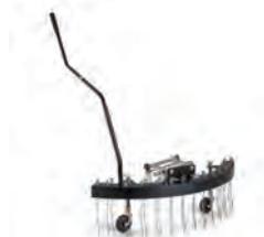
43. Green keeper