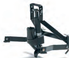
25. Rear tool lift electric